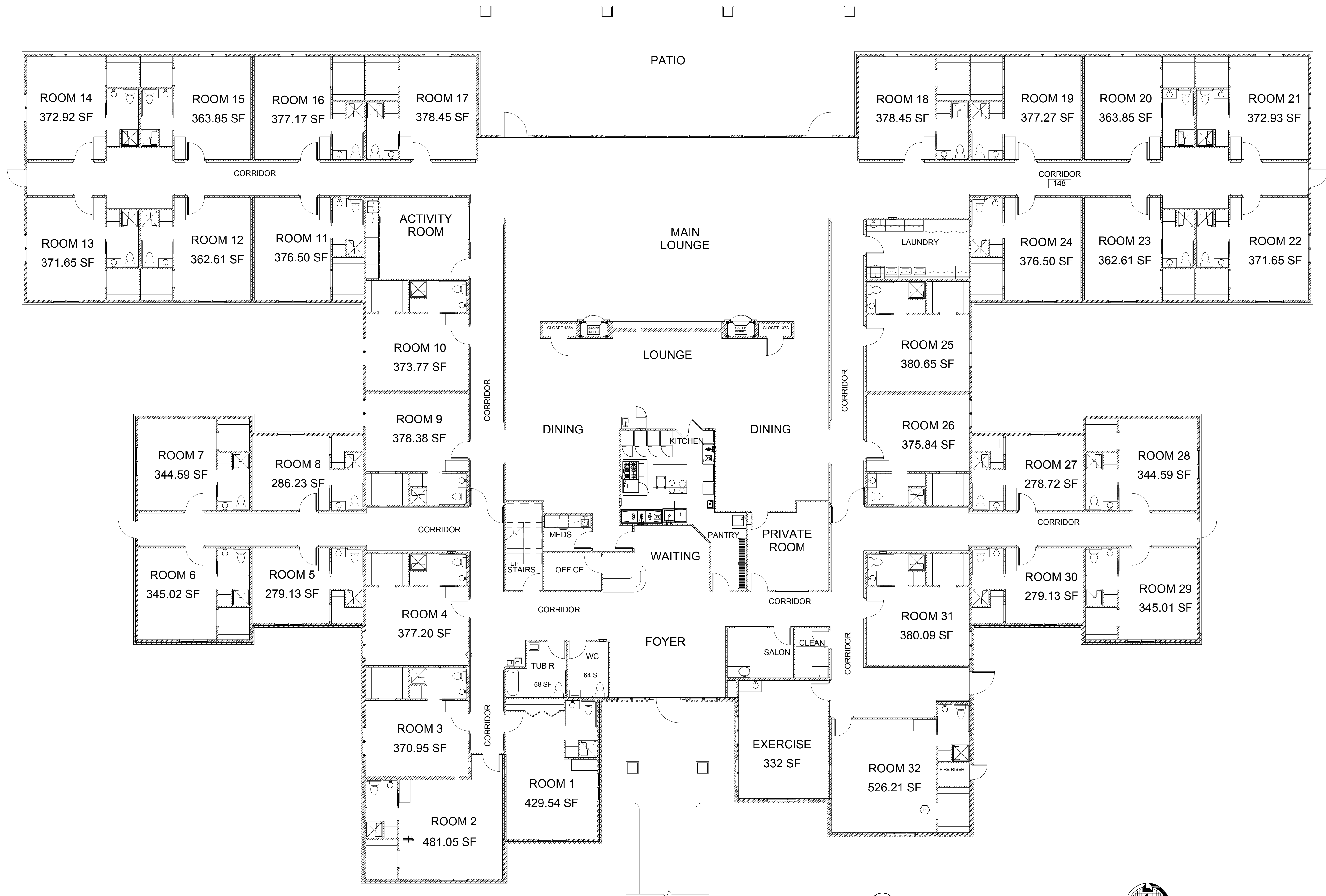
1 MAIN FLOOR PLAN 1/8" = 1'-0"